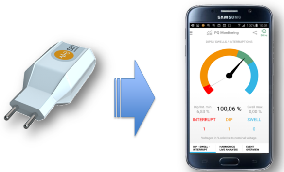
Charger USB charging and measurement

Combined with adapter hardware and app, compatible Android phones can be used as measuring device.