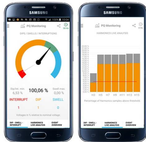
Figure 3 Power quality monitoring for dips/swells/interrupts (left); harmonics (right)

After each half interval 1/2 T , voltage dip/swell/interrupt conditions are tested. Undue voltage deviation is logged immediately and shows up as an entry in the "PQ Event Overview" screen (Figure 4).